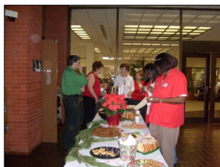
Library Wassail December 2007